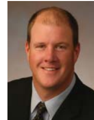
Jim Abbott "ADAPT" MLB Player, Olympic Gold Medalist