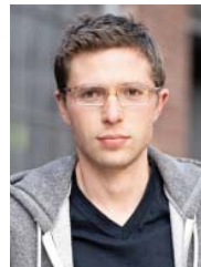
Jonah Lehrer "How We Decide" Rhodes Scholar, author and editor at large for SEED magazine.